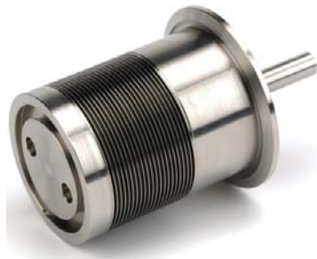
Edge Welded Bellows

This combination of attributes makes electrodeposited bellows ideal for extremely sensitive, precision instrument applications. Similarly, electrodeposited bellows are seamless and non-porous - additional attributes that are important in semiconductor-related applications, where minimizing the potential for contamination is a key consideration.